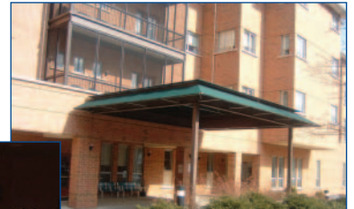
Gilpin Hall, Gilpin Avenue, Wilmington